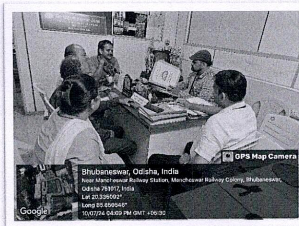
Members attending DC Meeting on 27/8/25 at 3.30pm in HOD Chamber of CSE Dept.